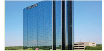
ELEMENT TOWERS EAST 3030 LBJ Frwy Dallas, TX