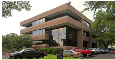
THE ESCALADE 4301 Westbank Rd Austin, TX

Cameron Tapley | 214-365-2796 (O) 214-808-3535 (C)