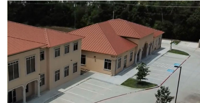
CHASE OAKS PLAZA 6521 Chase Oaks Blvd Plano, TX