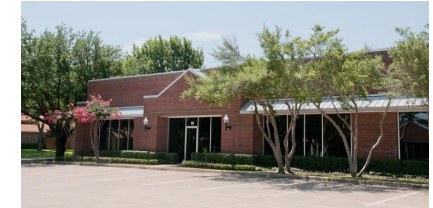
RICHARDSON DRIVE PLAZA 1475 Richardson Dr Richardson, TX