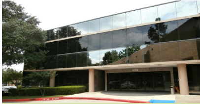
FORUM II 4004 Beltline Rd Addison, TX