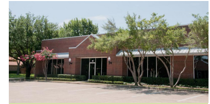
RICHARDSON DRIVE PLAZA 1475 Richardson Dr Richardson, TX