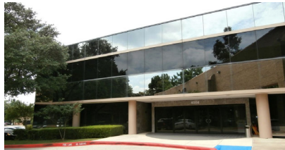
FORUM II 4004 Beltline Rd Addison, TX