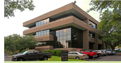
THE ESCALADE 4301 Westbank Rd Austin, TX

Cameron Tapley | 214-365-2796 (D) 214-808-3535 (C)