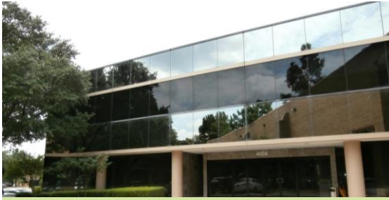
FORUM II 4004 Beltline Rd Addison, TX