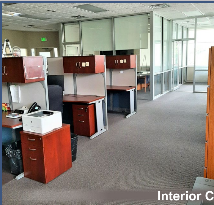
Interior Cubicle Space