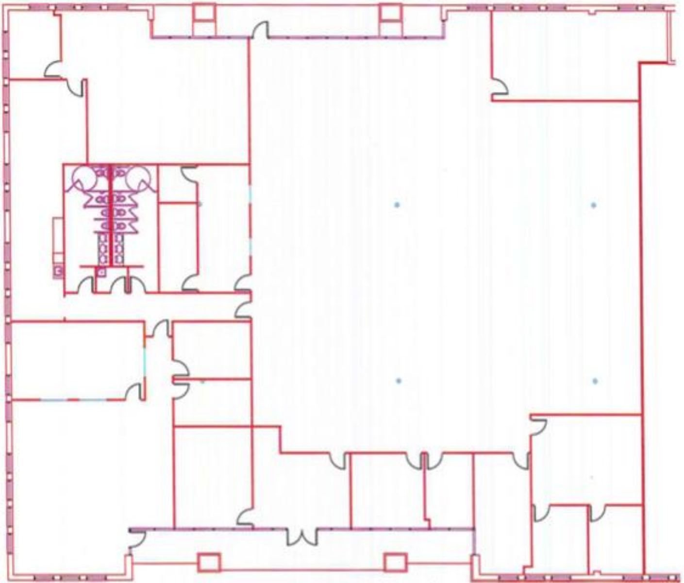
4145 Shackleford Suites 330-340